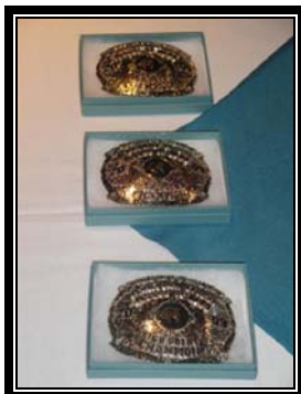
Awards were beautiful