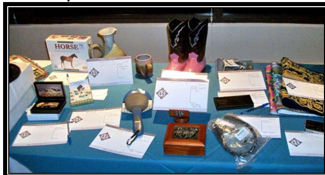
A Big Thank You for all the donated auction items